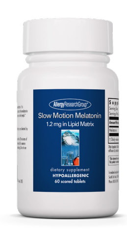
SKU #72231 60 scored tablets