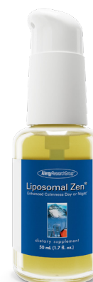
Item #76810 50 mL (1.7 fl. oz.)

Liposomal Zen® is an advanced delivery version of our product, 200 mg of Zen.* Its liposomal delivery system uses phospholipids for increased direct absorption.* The unilamellar (single bilayer) liposomes encapsulate the ingredients inside a spherical phospholipid bilayer membrane, which allows increased direct absorption in the upper intestine.*