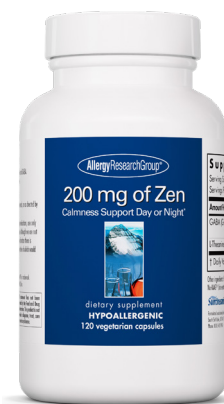
Item #74700: 60 vegetarian capsules Item #76650: 120 vegetarian capsules