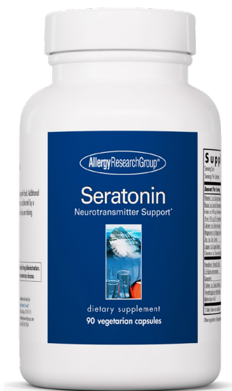
#76020 90 vegetarian capsules

Seratonin is a patented nutritional formula designed to enhance healthy moods and sound sleep.* Seratonin™ contains a combination of nutrients formulated to support a balance of two key brain neurotransmitters, norepinephrine and serotonin.* Additionally, the formula provides nutritional support for blood sugar within normal levels.*