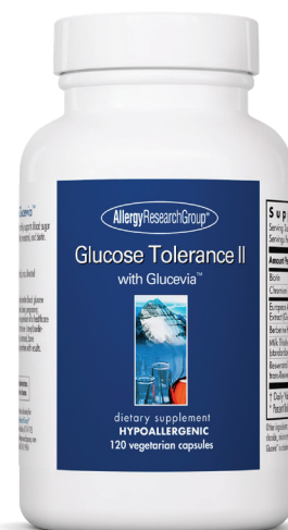
SKU #76890 120 vegetarian capsules