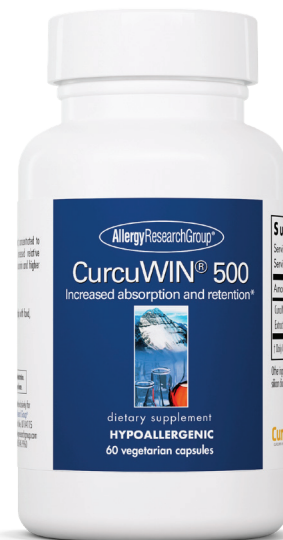
SKU #77290 60 vegetarian capsules