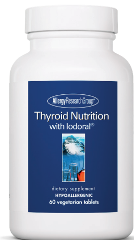
Item #77670 60 vegetarian tablets