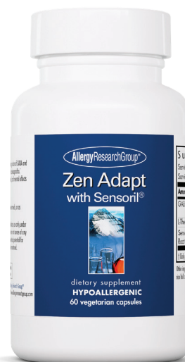
Item #77340 60 vegetarian capsules